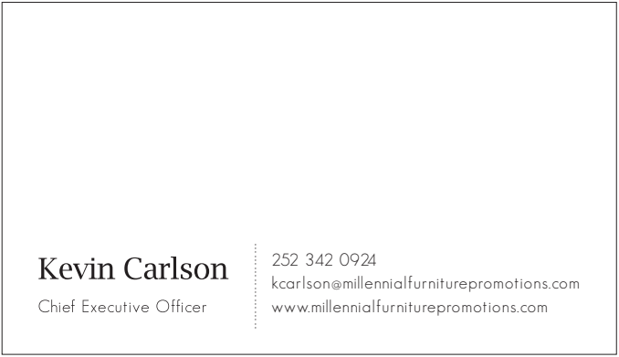
MATTE GOLD FOIL